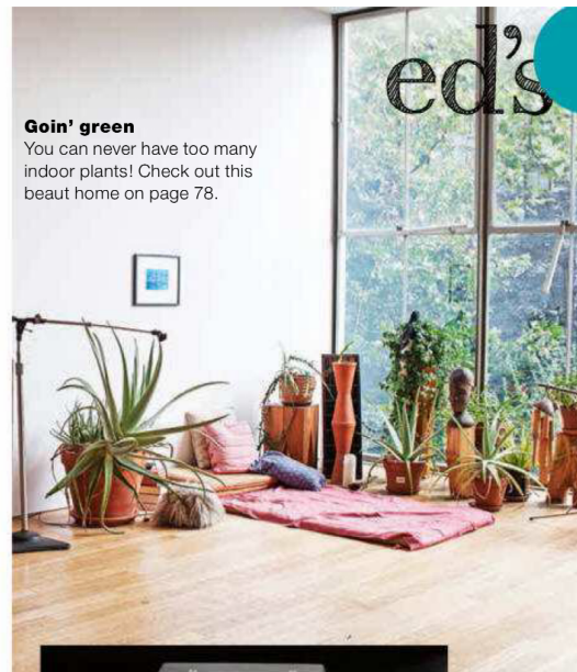
Goin' green You can never have too many indoor plants! Check out this beaut home on page 78.