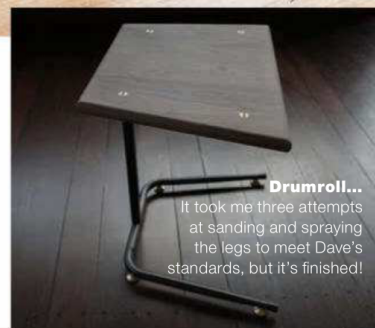
Drumroll... It took me three attempts at sanding and spraying the legs to meet Dave's standards, but it's finished!