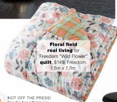
Floral field real living for Freedom "Wild Flower" quilt , $149, Freedom. 1.5m x 1.7m.