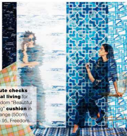
Cute checks real living for Freedom "Beautiful Thing" cushion in Orange (50cm), $39.95, Freedom.

Who, what, where: wallpaper Be bold and transform your home with gorgeous wallpaper! Turn to page 55 for the lowdown.